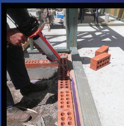
Installing Ura-Fen into Cavity

CONTAINING BIFENTHRIN FOR YOUR PEACE OF MIND