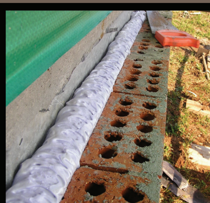
Ura-Fen installed into cavity

Ura-Fen is the perfect termite protection for monolithic, in fill or footing slabs, bearer and joist treatment, tilt panels, block-outs, large joints and gaps, penetration protection and many more useful applications.