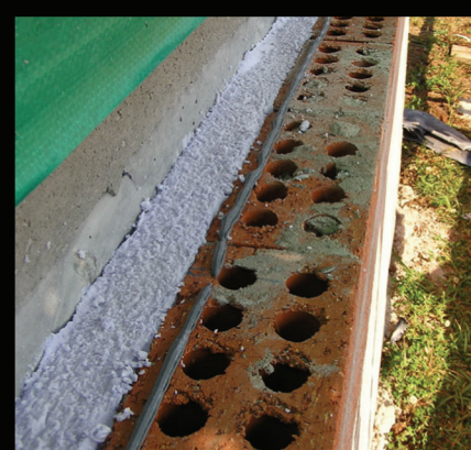
Ura-Fen cavity treatment trimmed