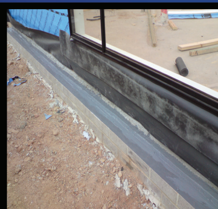
Complete Ura-Fen cavity Perimeter with TERM-seal cord strip and Multi-Purpose coating